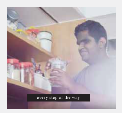
Closed captioning displays the audio portion of a television programme, video, movie or computer presentation as text on the screen.

Employees with hearing impairment may not be able to fully capture all of the discussion pointers raised during presentations and meetings. When using multimedia content like video clips, they may not be able to fully understand the context or information within the videos if there is no closed captioning.