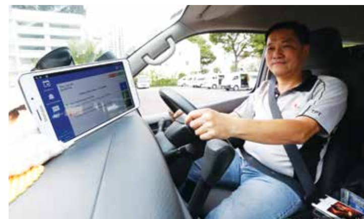
A driver using the HeartWheels® app to manage his daily schedule – the app also features GPS routing, messaging, and client contact functions

SGE also embarked on projects to catalyse the use of technology to benefit persons with disabilities. One such example is the development of HeartWheels®, an electronic transport management system that helps disability transport providers and care centres arrange rides for persons with disabilities more efficiently.