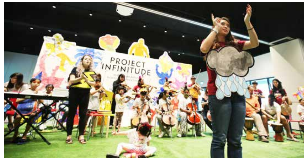
Children from low-income households or with special needs got a chance to show off their new found music skills in "Reach for the Stars". The music showcase was the highlight of several weeks of training, during which the children learnt to play a musical instrument