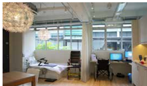
The technology-enabled home office showcases universal design and AT possibilities in homes and home offices