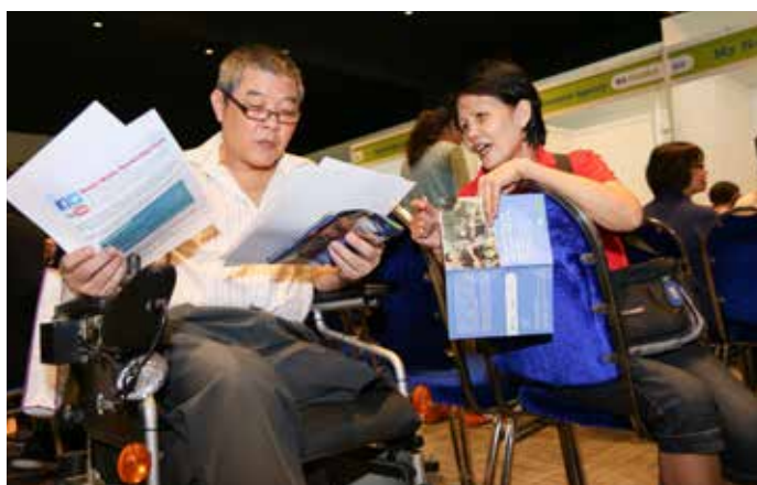
SGE Training and Career Fair with over 200 training and career opportunities