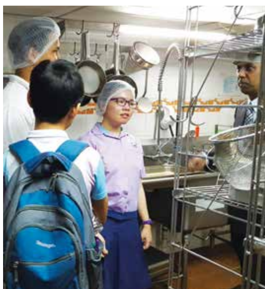
Grace Orchard School students visiting a Holiday Inn hotel on Job Shadowing Day