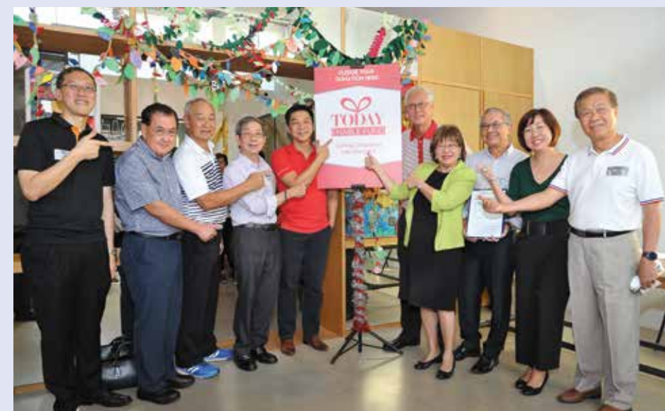
The TODAY Enable Fund was launched by ESM Goh on 2 December 2016

TODAY Enable Fund (TEF) was set up in December 2016 by TODAY with ESM Goh Chok Tong as the fund patron. TEF focuses on enhancing the education, skills and employment prospects of persons with disabilities, and fostering greater empathy and inclusion in our society.