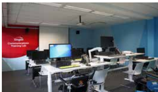
The Communications Training Lab features height-adjustable tables which are accessible to wheelchair users

Jointly managed with SPD, Tech Able reaches out to professionals and members of the public through its AT showcase and education efforts. It also provides AT assessment and training for persons with disabilities. In FY16, over 6,000 people visited Tech Able, while over 300 persons with disabilities received AT assessment and training.