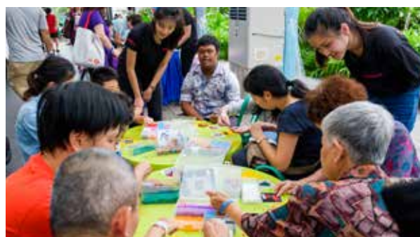
Visitors enjoying activities and performances at EV's 1st anniversary carnival