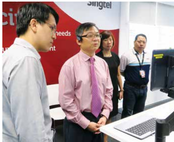
Minister Gan Kim Yong learning about assistive technology at Tech Able