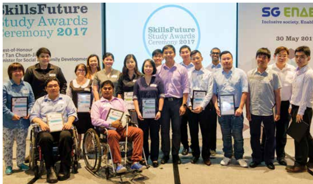
Mr Tan Chuan-Jin, Minister for Social and Family Development, gave out awards to SkillsFuture Study Award recipients